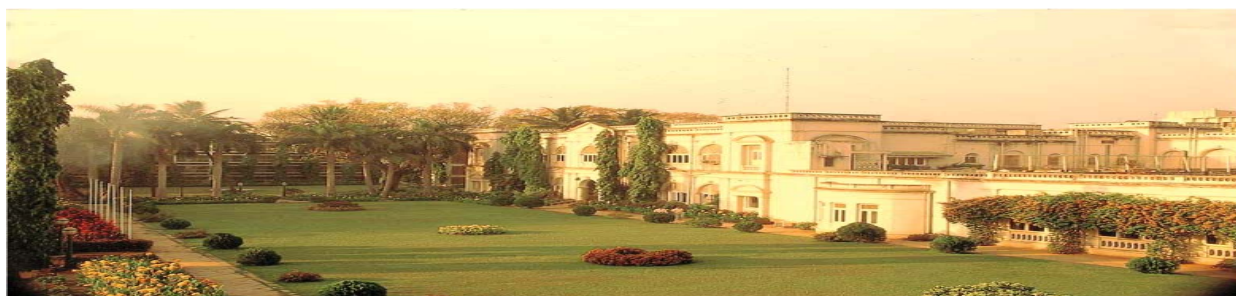
The Bella Vista Campus of ASCI – The Erstwhile Palace of the Prince of Berar

The Centre for Excellence in Management of Land Acquisition, Resettlement and Rehabilitation (CMLARR) , Administrative Staff College of India, (ASCI), Hyderabad, established with the support of the World Bank and AusAID has been leading the capacity building interventions for LARR specialist officers in the South Asian region. Among the prominent international assignments successfully completed by the Centre include “Formulating a National Resettlement Policy” for the Ministerial delegation from Government of Uganda; Customised Course on Improved Management of LARR for Senior Officials of Government of Egypt; Support for reforms in LARR and developing of SIA Guidelines for Govt of Egypt; the Joint Certification Courses with National Research Centre for Resettlement, China, International South-South learning event on R & R and Benefit Sharing; etc. In India, CMLARR has been involved in extensive capacity building and implementation support for the new Land Acquisition Act, 2013 for various stakeholders, including central/state governments.